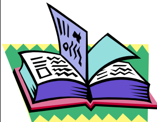
Simple Peter’s Mirror