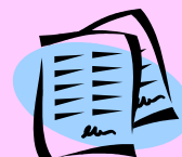
Learner work sample