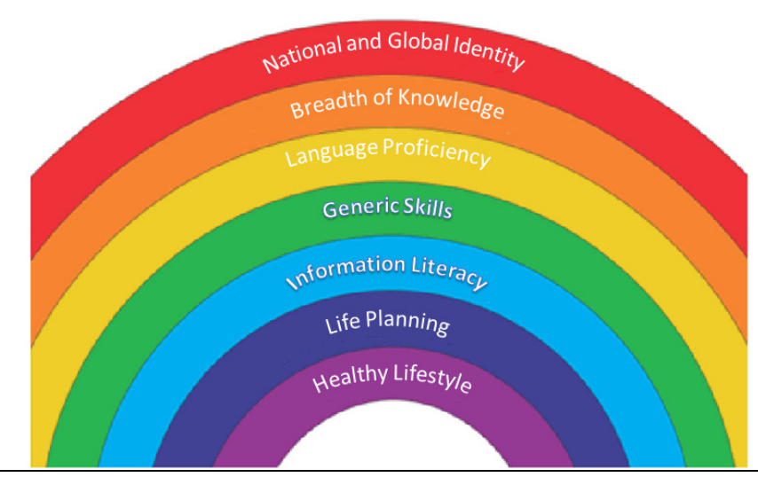
The Updated Seven Learning Goals of Secondary Education

The seven learning goals should continue to converge on promoting the whole-person development and lifelong learning capabilities of students, and updates are made with better clarity to take into account the changes in society and the experience gained in the curriculum reform at the school and KLA levels.