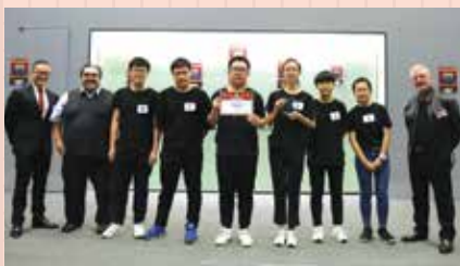
Hong Kong & Kowloon Chiu Chow Public Association Secondary School