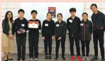
Yan Chai Hospital Wong Wha San Secondary School