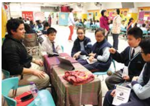
Playing with toys from El Salvador

This year the students played with some cool toys from El Salvador and the 'German books' told them where their favourite Kinder and Haribo treats came from. The 'Irish book' had lots of wonderful pictures of monuments from around the world that were made green for St Patrick's Day. At the India stand were some amazing musical instruments and the students loved getting involved with some Indian dancing.