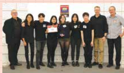
Jockey Club Ti-I College