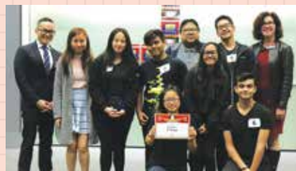
CCC Kwei Wah Shan College