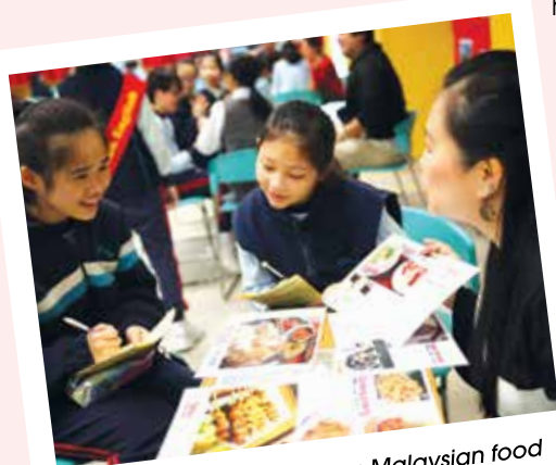
Learning all about delicious Malaysian food