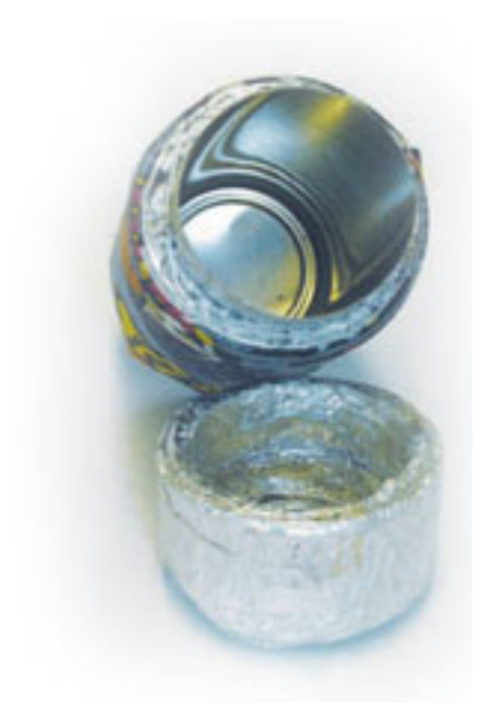
An aluminum thermo-cup designed by a student

• Energy gain and loss is introduced under the topic "Life in space" in the Science (S1-3) curriculum. In discussing the life of astronauts in space, students come to realize the need to maintain body temperature in space. As an introduction to the study of the design of a space suit, the teacher asks students to design and make a thermo-cup. This serves the purpose of illustrating the idea of preventing energy loss.