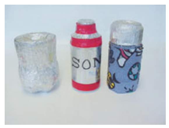
Three thermo-cups designed by students

After different groups have made their thermo-cups, the teacher leads the whole class to design a fair test to test for the effectiveness of their thermo-cups. The whole class has to decide what measurements to make, what variables to keep unchanged, and how to improve the reliability of the results. Finally, the effectiveness of each thermo-cup is tested according to the criteria the whole class has agreed upon.