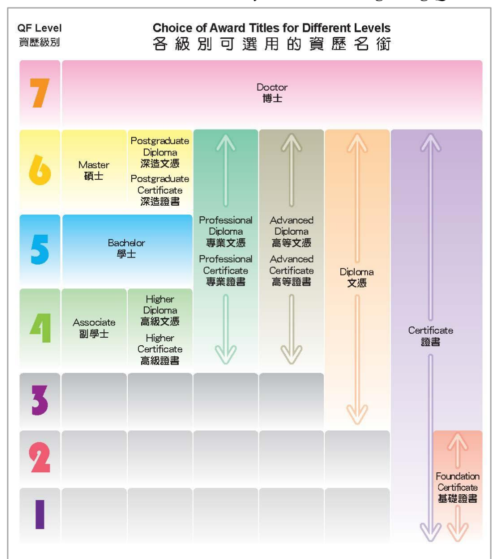
Chart 1.2 Seven-level hierarchy under the Hong Kong QF