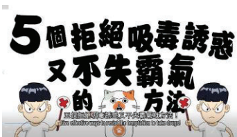
“Ah Keung Story”