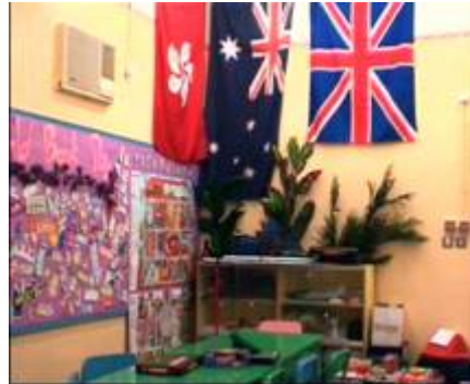
Trip to England