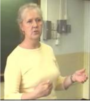
One of the two NET teachers