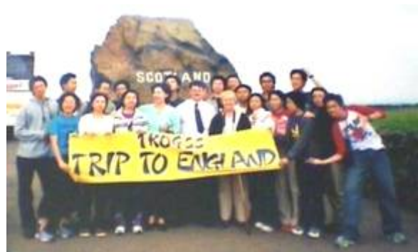
Participants in 2001

This English Enhancement Measure was regarded as exemplary good practice because of the originality of its conception and organisation and its impact on both the participants and the wider school community.