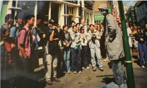
The 20 participants in 2001