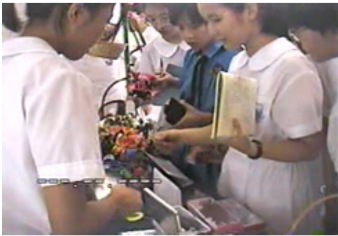
Interaction during a fund-raising activity

The programme of fund-raising required everyone to use English: the potential participants and the other students. The impact on the school community was something that built up over the year. The trip began to become part of the school culture, with students in lower forms setting their sights on a similar trip when they entered S.6.