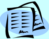
You Can Make a Difference