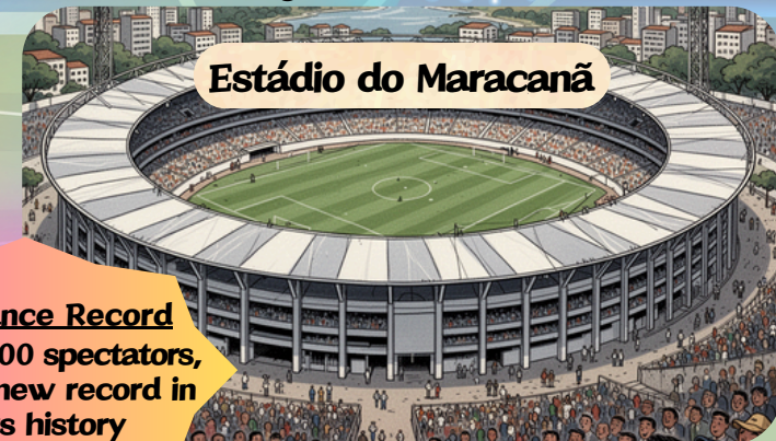
Estádio do Maracanã

Classic Battle: Uruguay defeats Brazil (host country) in the final, creating the "Maracanã Smash"