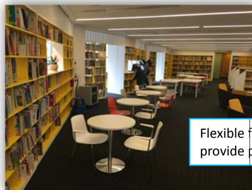
Flexible furniture arrangements to provide presentation space.

The school adopts flexible furniture arrangements in the library to provide presentation space and seminar areas for large groups of teachers and students. Such arrangements facilitate students' group reading, as well as knowledge building and enquiry learning activities.