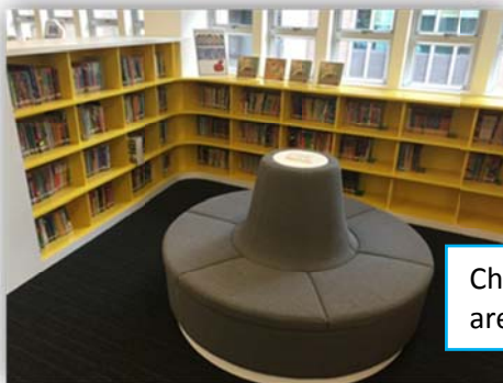
Charging stations for mobile devices and areas for mobile learning.

The school adopts flexible furniture arrangements in the library to provide presentation space and seminar areas for large groups of teachers and students. Such arrangements facilitate students' group reading, as well as knowledge building and enquiry learning activities.