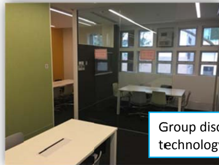
Group discussion rooms with technology resources.