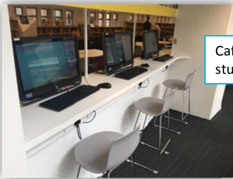
Café-style environment with computers for students to conduct enquiry and exploration.

Four special group discussion rooms of varying sizes with digital and technology resources are now available. Students can conduct different types of enquiry learning activities for different subjects (including PSHE subjects) in these rooms, such as group projects and discussion. Such social learning spaces facilitate collaborative learning and the sharing of ideas among students.