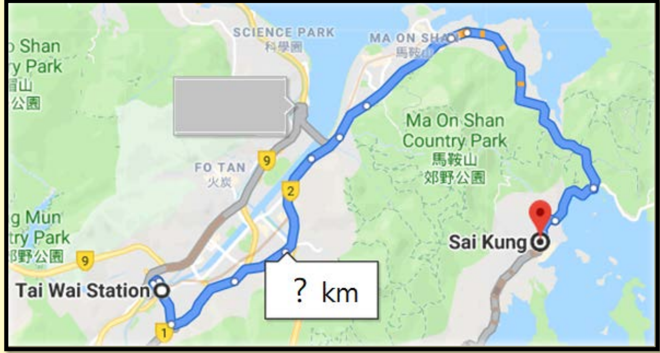
Export from Google Maps