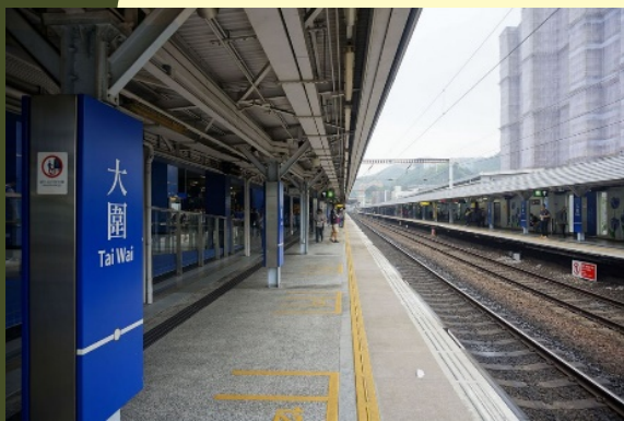
Tai Wai Station