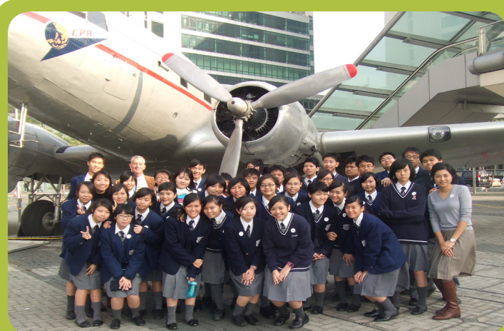
Yan Chai Hospital No. 2 Secondary School students and teachers in front of the DC3 at Cathay Pacific City