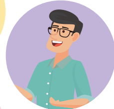
Special Educational Needs Coordinator