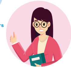
School Guidance Teacher, School Social Worker or other student guidance personnel