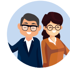
School Head and Teachers