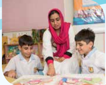
Parent-child reading e.g. picture books, newspapers