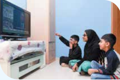
Watching TV programmes e.g. cartoon, drama, news