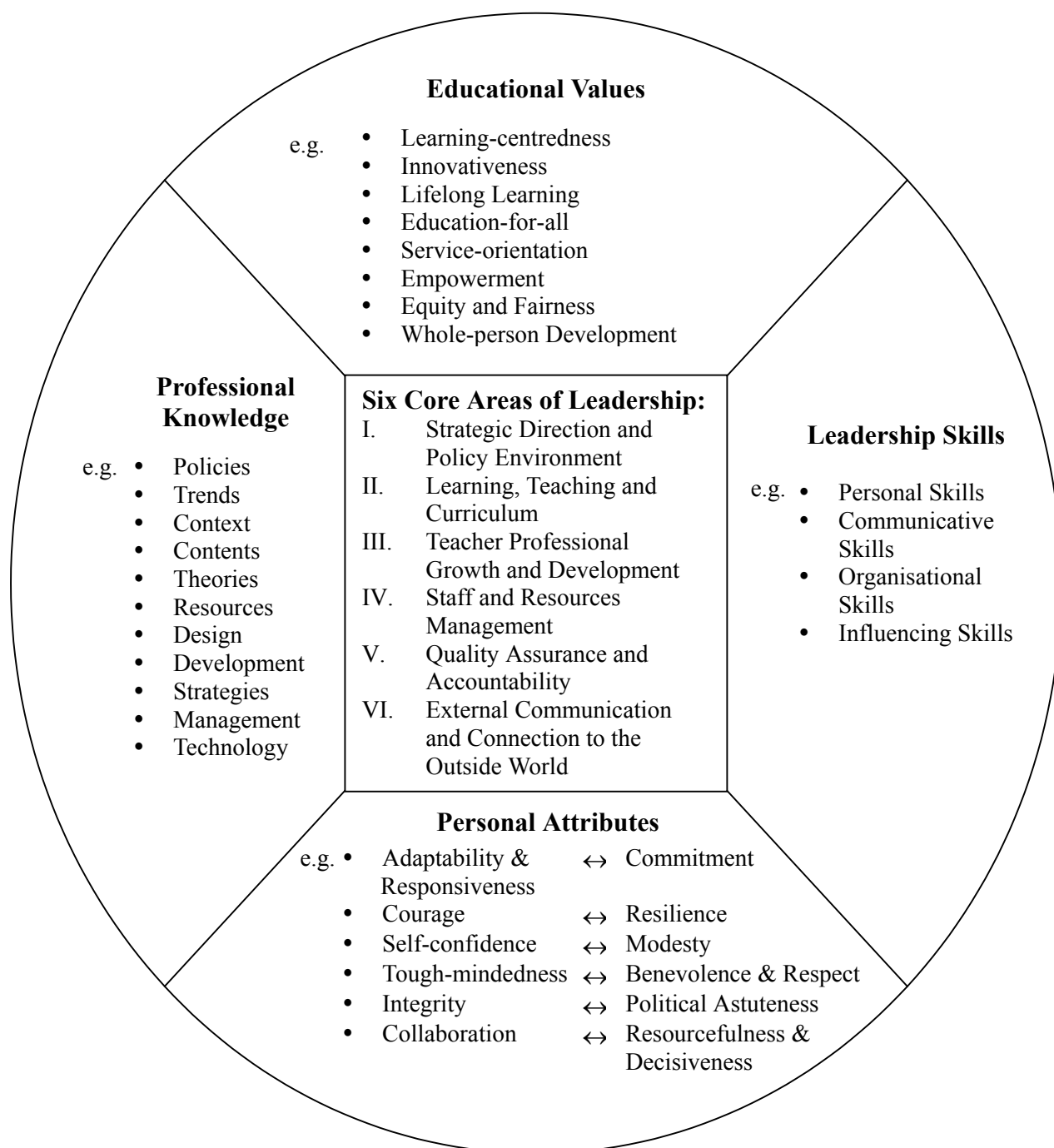
Illustration of the Values, Knowledge, Skills and Attributes in the Six Core Areas of Leadership