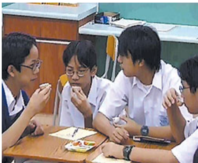
Students tasting tea during a project lesson - a motivation activity for the project "Tea and Culture"