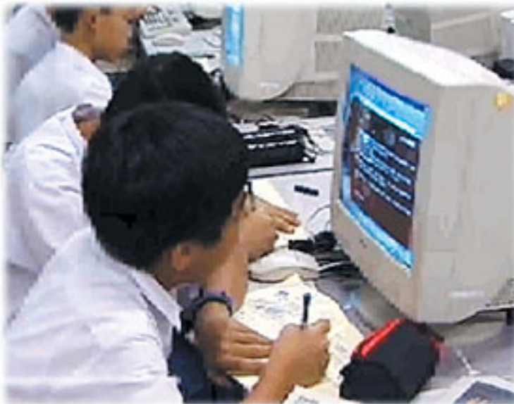
Students using the School's Intranet to do their projects