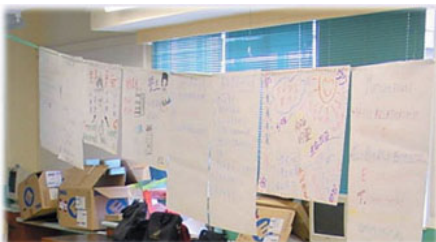
Project reports displayed in the classrooms