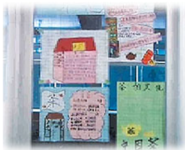
Posters designed by students displayed on classroom windows facing the corridor