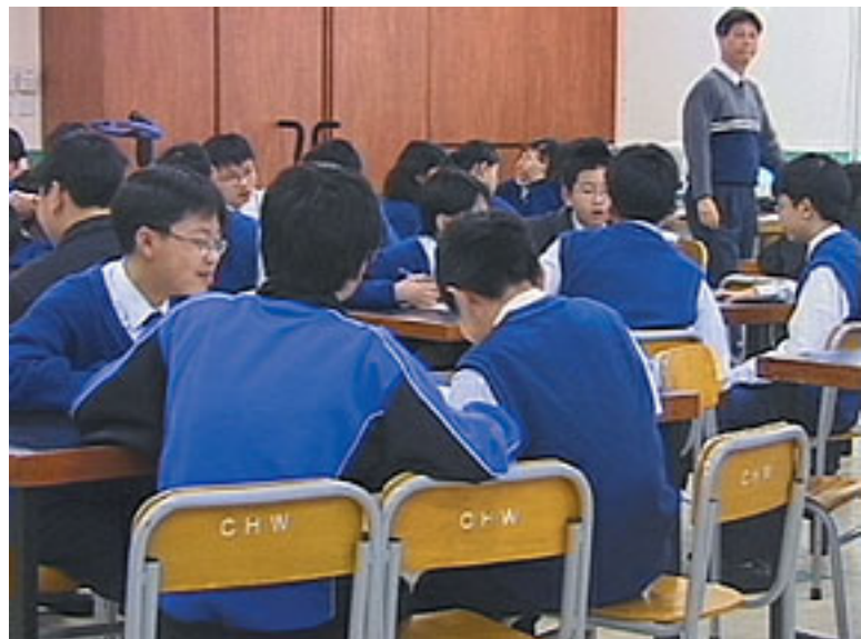
Students having a group discussion during a project lesson