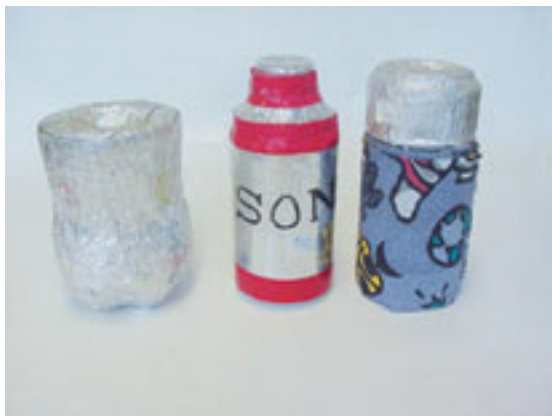
Three thermo-cups designed by students