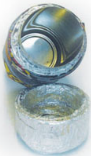
An aluminum thermo-cup designed by a student