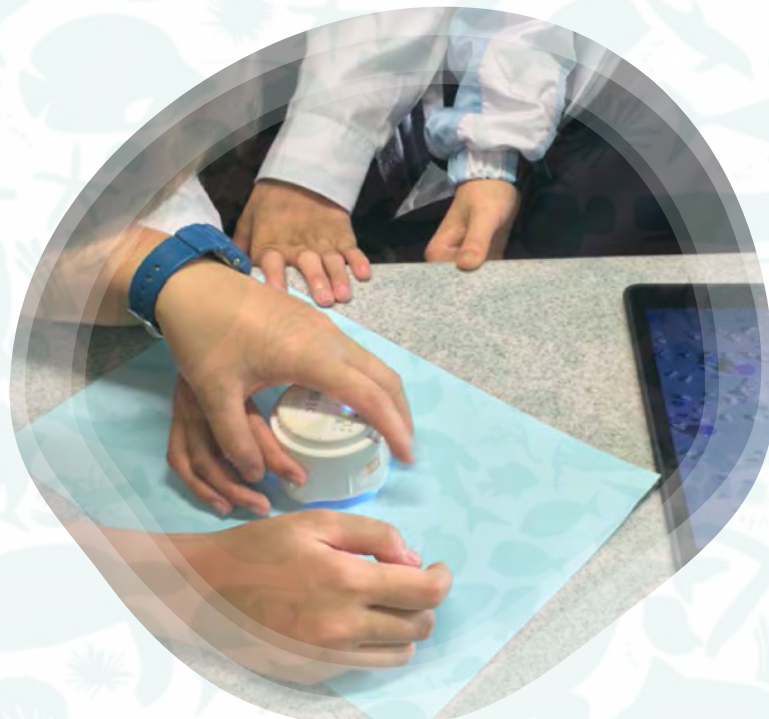
使用顯微鏡 Use of microscope