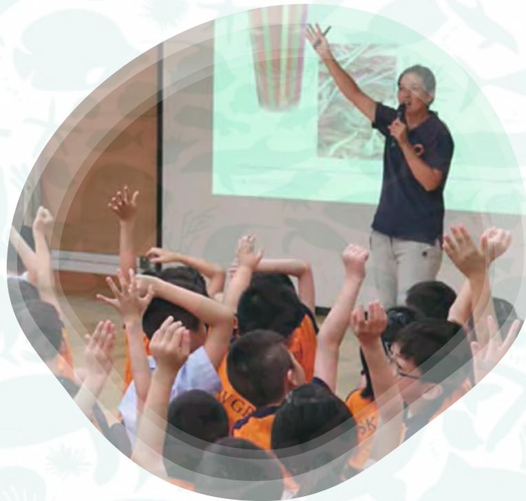
小學 Primary School