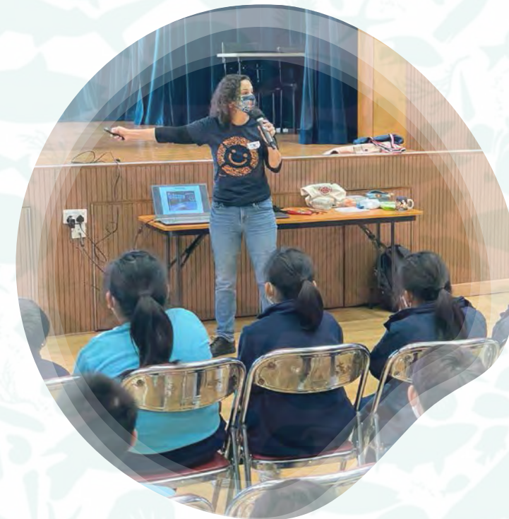
中學 Secondary School