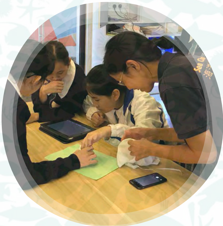
學生進行實驗 students' experiment